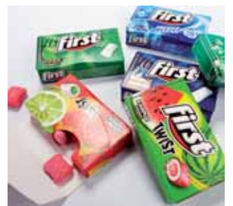
8 rlc packaging group