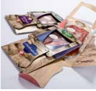
6 Schachner-Pack Gmbh