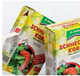
7 Karl Knauer KG