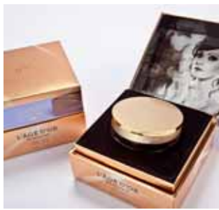
1 Cartondruck GmbH