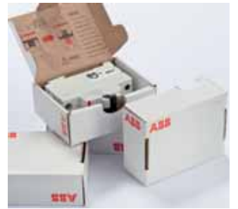
7 Lucaprint S.p.A.