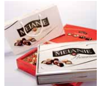
③ JV VG Kvadra Pak