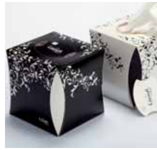
1 MMP CP Schmidt