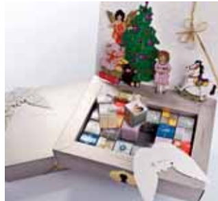
③ Offsetdruckerei Schwarzach GmbH