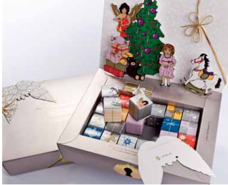
Official name of entry | Adventskalender 2012