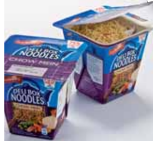
6 The Alexir Partnership