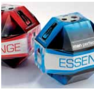
1 MMP Neupack Polska