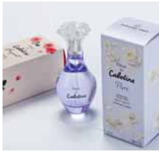
1 Carl Edelmann GmbH