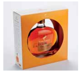
2 VG Angoulême