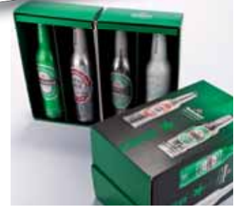
② Smurfit Kappa Zedek