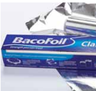
8 Lucaprint S.p.A.