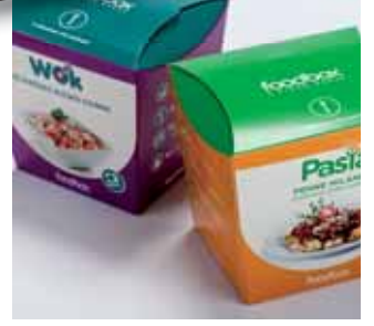
6 STI Petöfi Nyomda Kft.