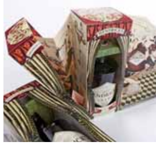
② Chesapeake Branded Packaging