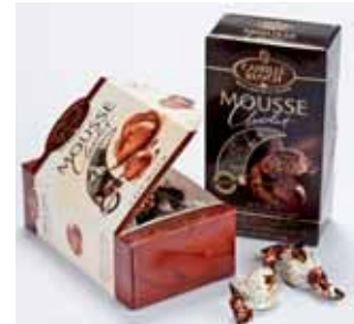
③ Schelling AG