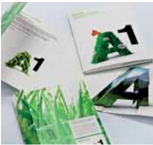
7 MMP Neupack