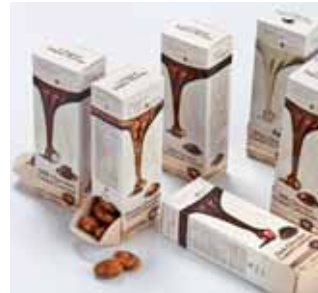
③ Edelmann Group