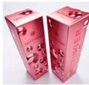
2 VG Angoulême