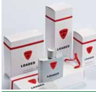
1 Carl Edelmann GmbH