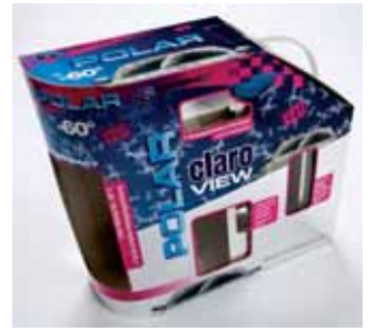
7 MMP Neupack