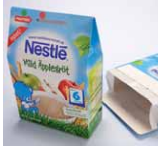
6 A&amp;R Carton Lund AB