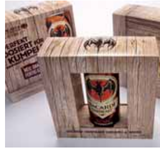
② STI Schröder Verpackungen GmbH