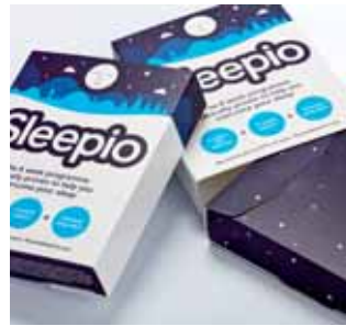
7 Firstan Ltd