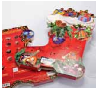
③ Chesapeake Branded Packaging