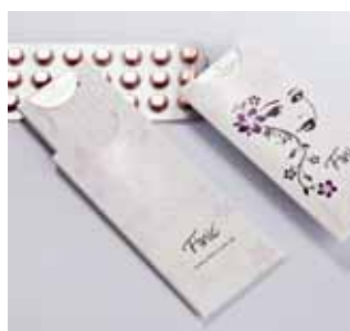
④ Carl Edelmann GmbH