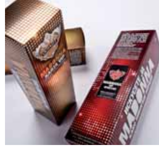
② Cartondruck GmbH