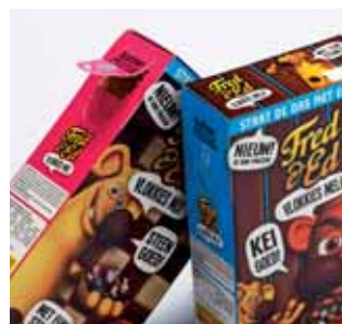
8 Contego Packaging