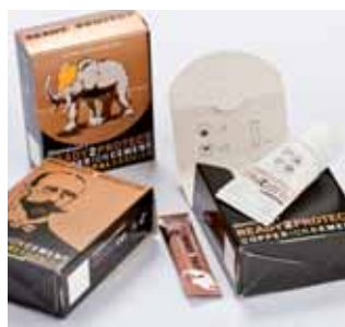
④ August Faller KG