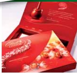
③ Chesapeake Branded Packaging