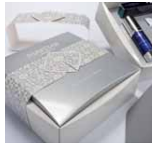
1 Karbest, S.L.