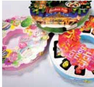
③ A&R Carton