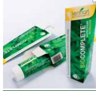
1 bandke consulting branding + design rlc packaging group