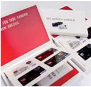
7 Bamberg kommunikation Höhing Druck Heilbronn