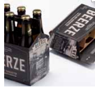
② A&R Carton BV