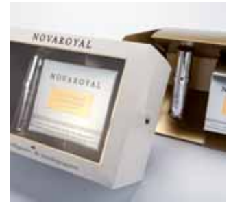
1 Marzek Group