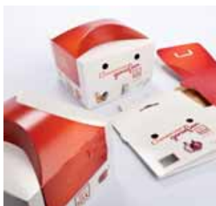
8 Van Genechten Biermans