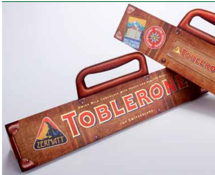
Official name of entry | Suitcase Sleeve, Toblerone 750g

An eye-catcher for the specific requirements of the Duty Free Market in current Smarties design. A multi-part round box with integrated carrying handle. The added bonus can be seen through the transparent lid and partially silhouetted metallised paper indicates the high quality.