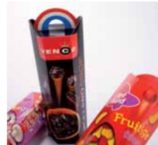
③ Eindhoven Packaging