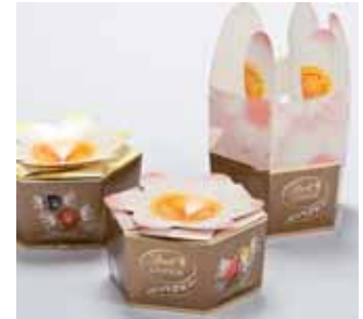
③ Model PrimePac AG