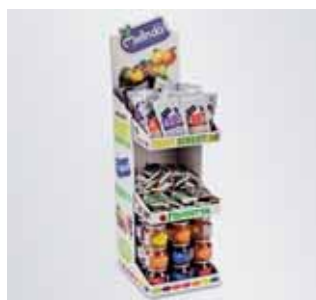
⑤ Lucaprint S.p.A.