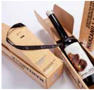
6 Karbest, S.L.