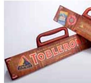
③ Model PrimePac AG