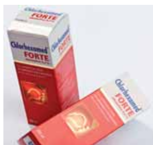
④ Karl Knauer KG