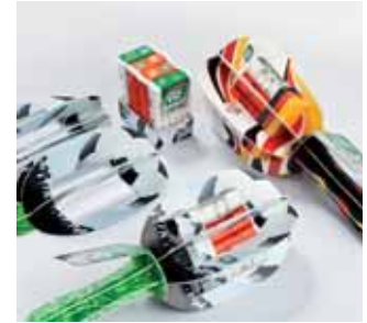
③ STI Group