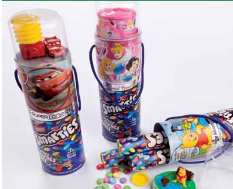
Official name of entry | Smarties Disney 3x Giant Tubes

A festive carton with an elaborate, integrated pop-up. High quality finishing provides especially attractive, delicate tactile effects. The packaging is also shelf-ready and can be refilled and re-used.