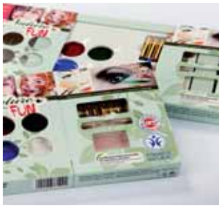
1 Schelling AG