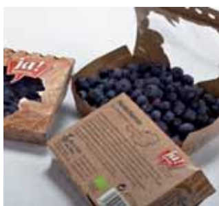
⑥ Ja! Natürlich, REWE Group Ratt