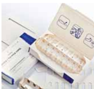
④ Carl Edelmann GmbH