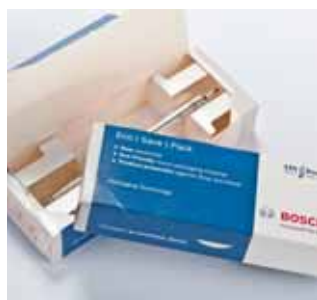
④ August Faller KG