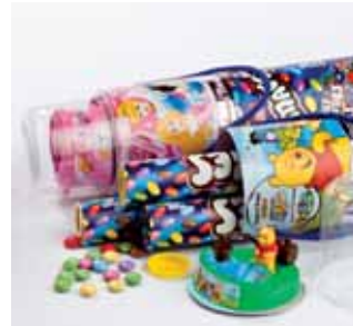
③ Chesapeake Branded Packaging