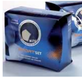
1 Chesapeake Branded Packaging