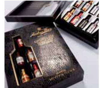
③ Chesapeake Branded Packaging