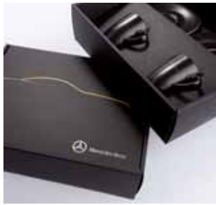
7 Siemer Kartonagen