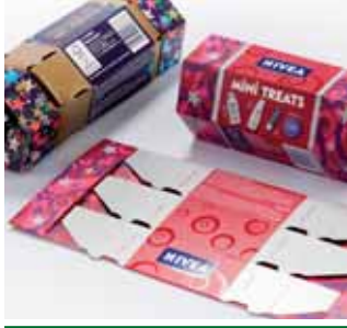
1 Clondalkin Pharma & Healthcare UK