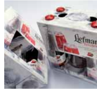
② Van Genechten Biermans