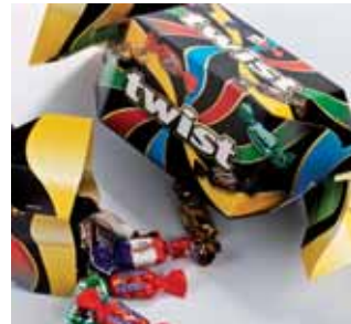
③ Model PrimePac AG