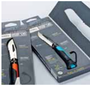
7 VG Angoulême