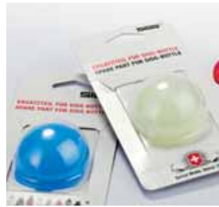
7 PAWI Verpackungen AG