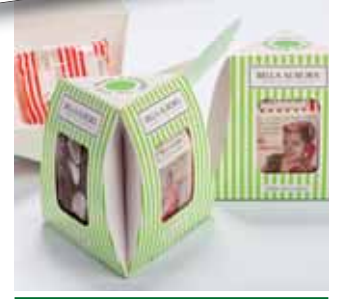
1 Karbest, S.L.