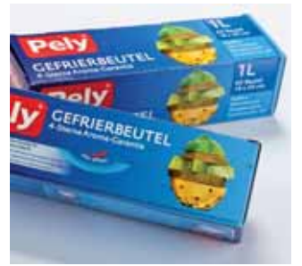
7 Redpack Brand Design Cosack